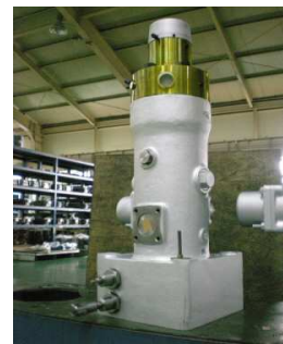
Outlet Pressure: 2000 BAR

And this is why, in test after test, PRI-XL consistently outperforms all others, ensuring that marine fuel pumps will continue to function - whether in normal use, or in mission critical situations.