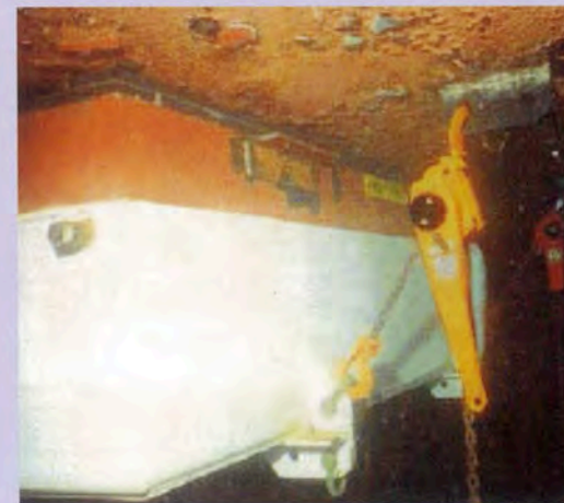
Cofferdam in place

We are approved by all the leading Classification Societies for carrying out insert renewal repairs.