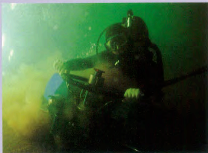
Hull cleaning in operation

This cleaning system has been approved by all the major paint companies.