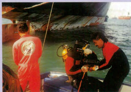
Preparing for underwater video survey

Underwater propeller polishing and maintaining smooth propeller surfaces are now fully appreciated, but propellers do foul up and for this we use our new improved THREE-STAGE reconditioning system to achieve a Rubert finish better than a Rubert 'A' on the Rubert Comparator.